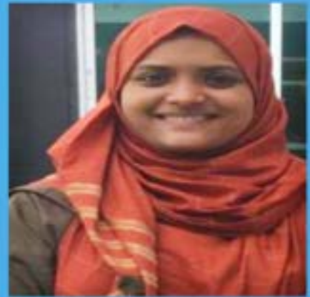
Our dearest teacher